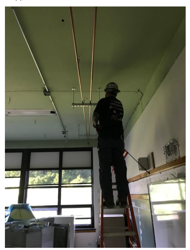
Hot water pipe installation